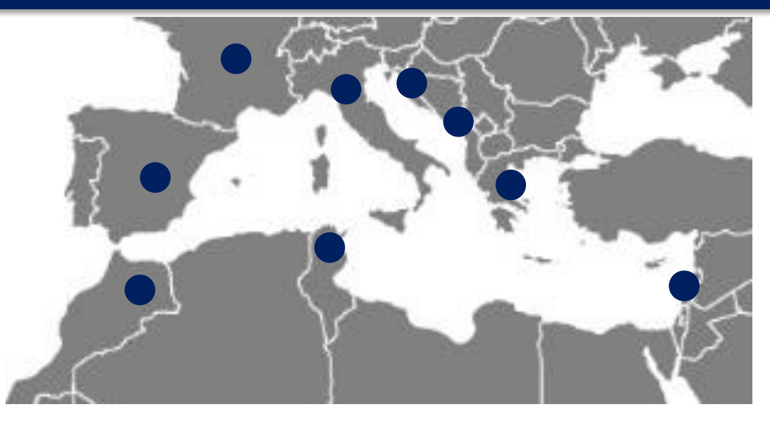
EU-MED PROMOTING PARTNERS ITALY - GREECE - CROATIA FRANCE - SPAIN