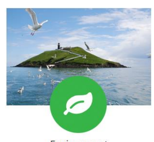
Environment Find out more