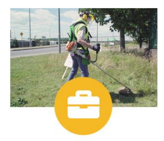
Enabling Employment Find out more