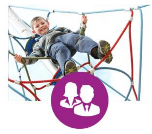
Corporate & Business Opportunities