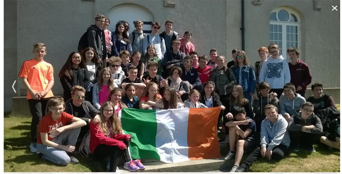
One of the many groups of foreign students who visit the centre throughout the year.