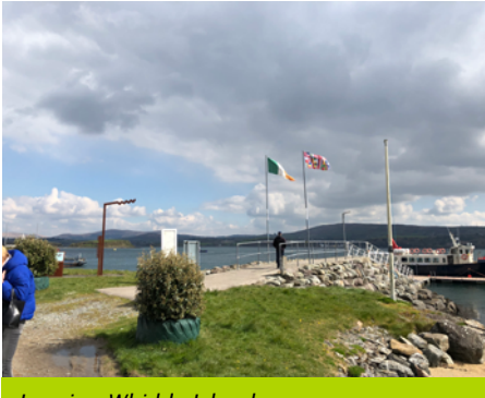
Leaving Whiddy Island

On the boat trip back from Whiddy Island, there was the chance to see the operations of Bantry Harbour Mussels Ltd. With EMFF funding, the company's mussel farming uses the eco-friendly "hairy rope" system; and new floats made from high-density polyethylene (HDPE), so they can be plastic welded, repaired and re-deployed if they get damaged.