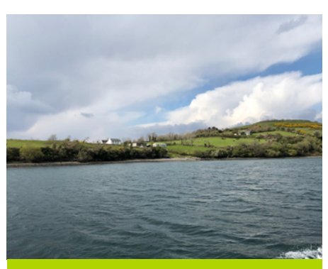
View of Bantry Bay