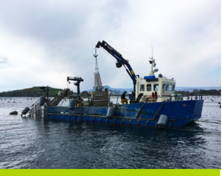
Mussel farming boat, Bantry Bay