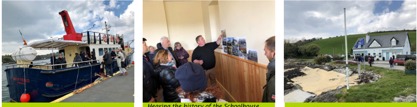
Ferry ride to Whiddy Island

The highlights of the field trip were a short ferry ride to Whiddy Island to hear about revitalising a small island community with a rich history at The Schoolhouse. Tourists come mainly for walking, and a rejuvenated the Schoolhouse would provide accommodation, storage lockers and drying facilities to support this activity - as well as serving as a heritage centre. The Schoolhouse is a recipient of EMFF-funding and is supported by South FLAG (IE).